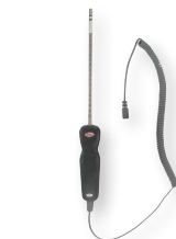
Replaceable probe with secure 6 pin adaptor