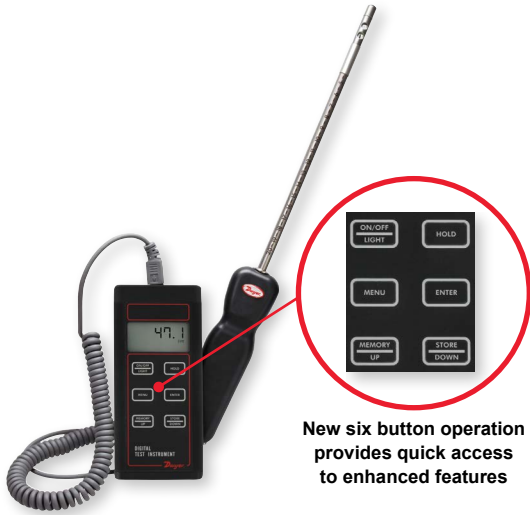
New six button operation provides quick access to enhanced features